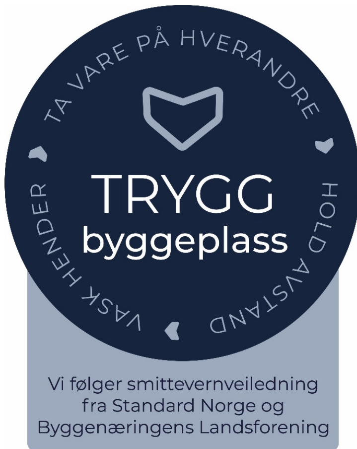
Figure 2 — Safe building site

Enterprises that undertake to follow the rules and implement the measures set out in this document may use the emblem shown in Figure 2.